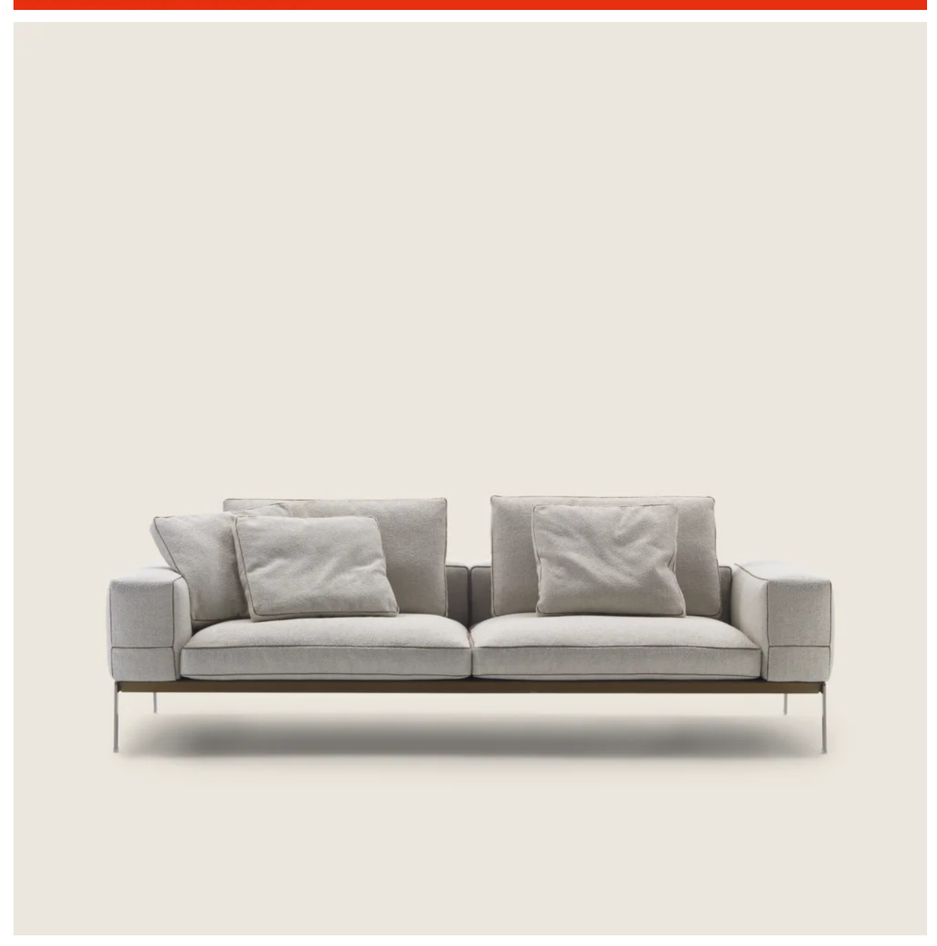
LIFESTEEL ANTONIO CITTERIO 2006 STAND-ALONE SOFAS