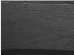
oak without knots pigmented: total black