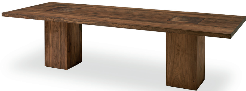
Table with top made of solid wood in glued lists, characterised by legs passing through the top surface, made from sections of tree trunks. Version with rectangular top and two legs.