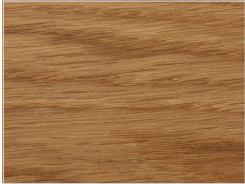
oak without knots