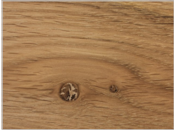
oak with knots