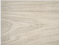
oak without knots pigmented: white milk