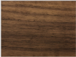
walnut without knots