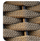
Nautic Rope Sand