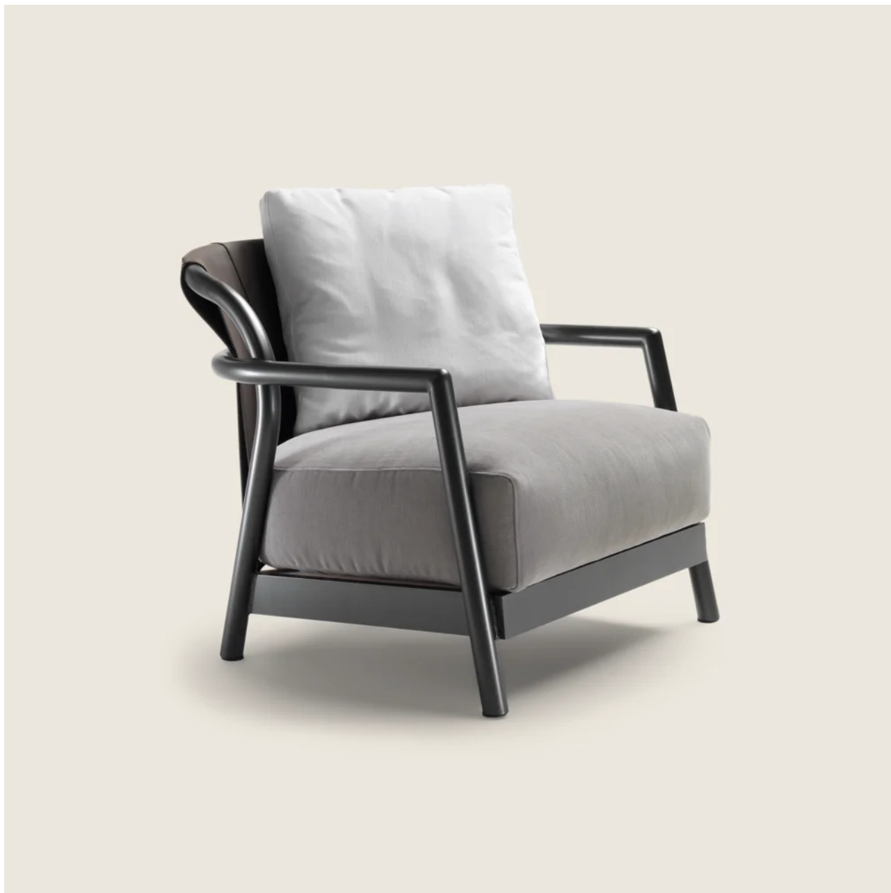
ALISON OUTDOOR2019 ARMCHAIRS