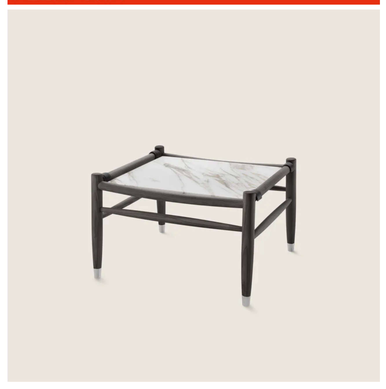
TESSA | TESSA S.H. ANTONIO CITTERIO 2020 COFFEE AND SIDE TABLES