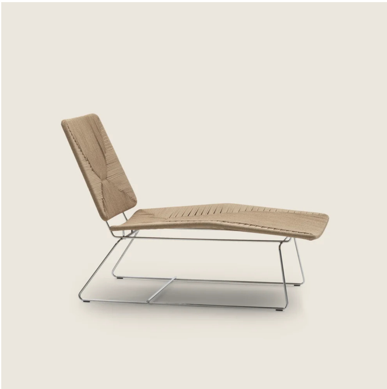
ECHOES | ECHOES S.H. CHRISTOPHE PILLET 2021 CHAISE LONGUE/DORMEUSE