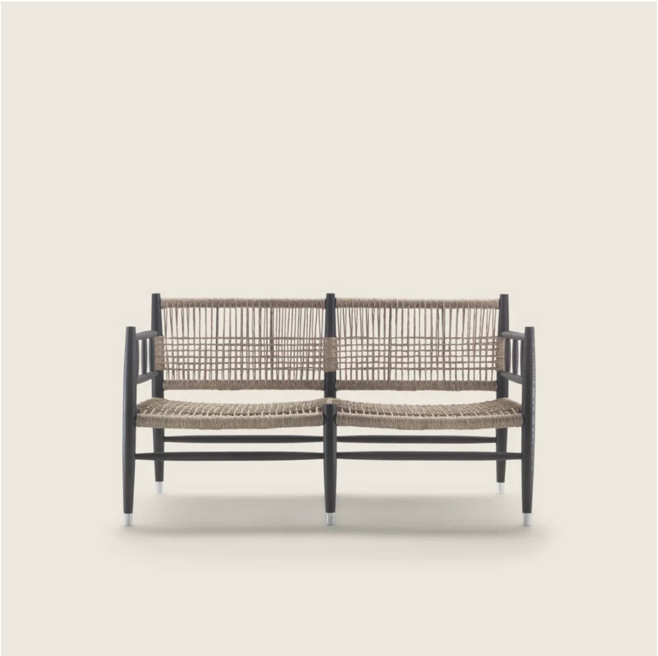
LEE ANTONIO CITTERIO 2021 STAND-ALONE SOFAS