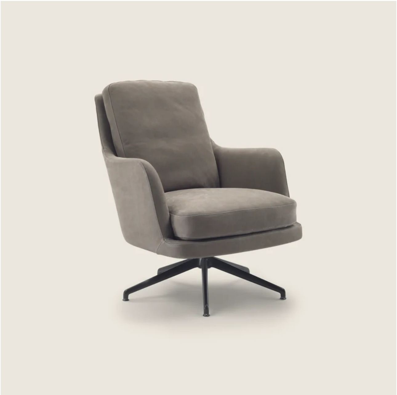
MARLEY ANTONIO CITTERIO 2021 ARMCHAIRS