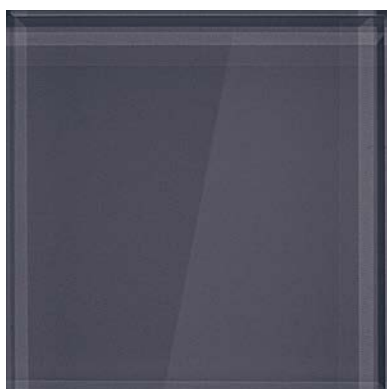
vetro fumé smoked glass