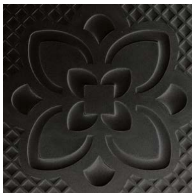
vetro extralight retroverniciato Nero Brillante back-painted extralight glass, Brilliant Black finish