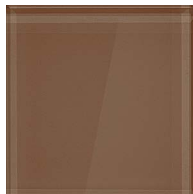
vetro bronzo bronze glass