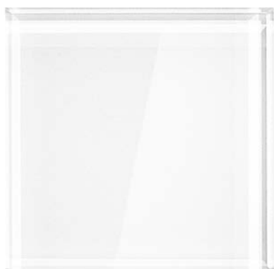
vetro extralight extralight glass