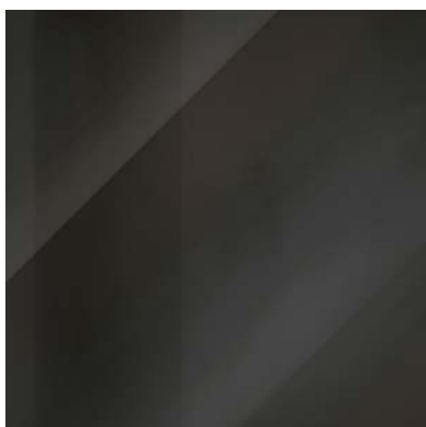
Nichel Nero Lucido Black Glossy Nickel