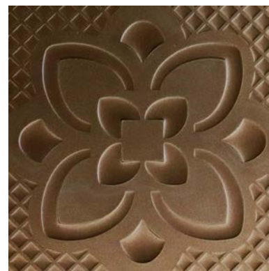
vetro extralight retroverniciato Marrone Brillante back-painted extralight glass, Brilliant Brown finish