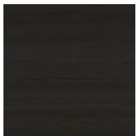
Veneered wood Coal ash

Materials, fabrics, leathers, colors and finishes are approximate and may slightly differ from actual ones. You can find the complete collection of Bonaldo fabrics and leathers on the website