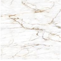
Silk finish ceramic Calacatta macchia vecchia