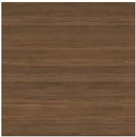
Veneered wood Walnut Canaletto