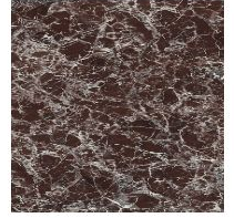
Glossy ceramic Rosso imperiale