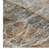
Glossy ceramic Mountain peak