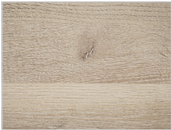
oak with knots pigmented: white milk