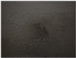
oak with knots pigmented: total black