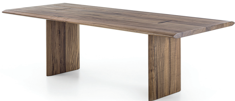
Table made with a solid wood top composed of glued slats, with visible through legs featuring a characteristic joint. The geometry of the joint is echoed in the cross-section of the top and legs, in a more elongated version to ensure both aesthetic and structural coherence.