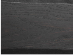
oak without knots pigmented: total black