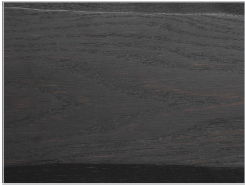
oak without knots pigmented: total black