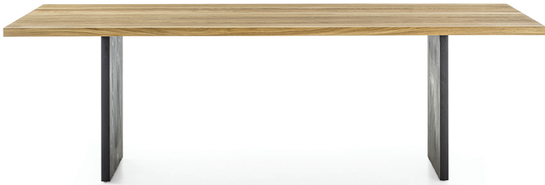
Table with a solid wood top, featuring glued slats with squared edges. The base consists of solid wood legs