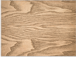
Pigmented ash: light brown