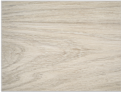
oak without knots pigmented: white milk