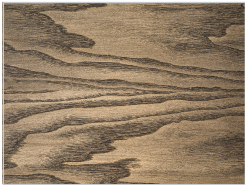
pigmented ash: dark brown