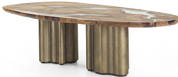
Table with a solid Kauri wood top, defined by a soft, sinuous organic outline inspired by the oval shape and finished with beveled edges. The base consists of two sculptural legs with a curvilinear, multi-lobed profile and a metallic-effect finish.