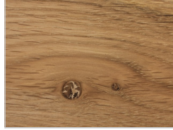
oak with knots