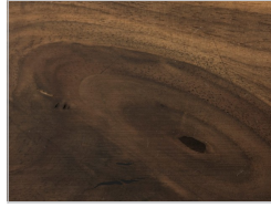
walnut with knots